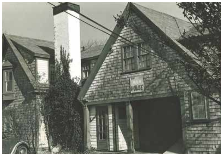
Original May Institute campus, Cape Cod, circa 1960

Three important centers—the National Autism Center at May Institute, and the May Center Schools for Autism and Developmental Disabilities in Randolph and Woburn—were launched in 2005 and are celebrating their 10th anniversaries this year.