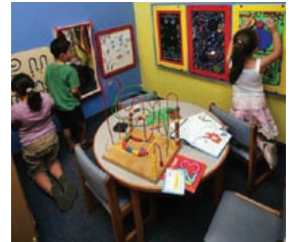
Children play in the reception area at the Fernandes Center for Children and Families.

FCCF provides research-based interventions to the community including outpatient diagnostic evaluations, psychological assessments, and treatment groups for children with diverse developmental, behavioral, or special health needs.